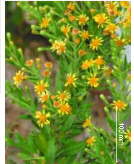
During summer and autumn, each bush can have hundreds of yellow flowers.

False yellowhead is native to southern Europe (including France, Spain, Greece,