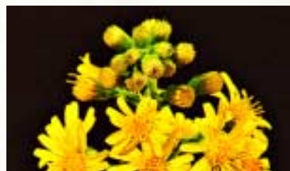
False yellowhead has spread hundreds of kilometres in 50 years.

Once the initial infestation is controlled, follow-up monitoring and control will be required to ensure that reinfestation does not occur.