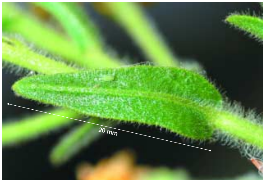
Hairs that cover the young stems and leaves exude a sticky foul-smelling oil.