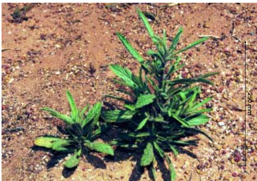
Stinkwort Dittrichia graveolens is a closely related agricultural weed of southern Australia.

False yellowhead has the potential to be a serious environmental weed, particularly in southwestern Western Australia and areas of similar climate in southern and eastern Australia, if it is allowed to spread. Infestations of false yellowhead would detract from the aesthetic and natural values of bushland and could reduce its tourism appeal. The costs of management (eg clearing from railway lines or walking trails) would also be significant.