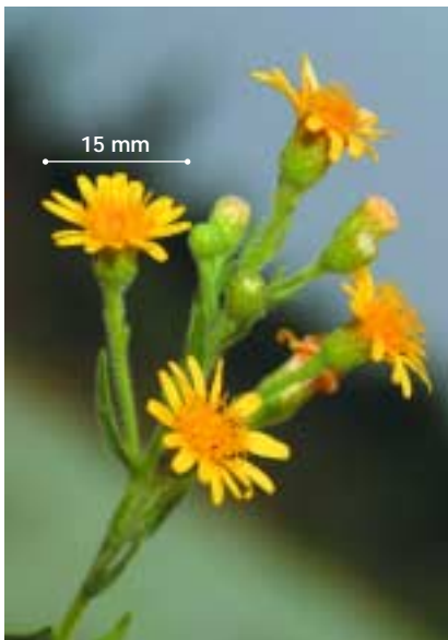
The daisy-like flowers occur in groups of 4–12.

The above contacts can offer advice on weed control in your state or territory. If using herbicides always read the label and follow instructions carefully. Particular care should be taken when using herbicides near waterways because rainfall running off the land into waterways can carry herbicides with it. Permits from state or territory Environment Protection Authorities may be required if herbicides are to be sprayed on riverbanks.